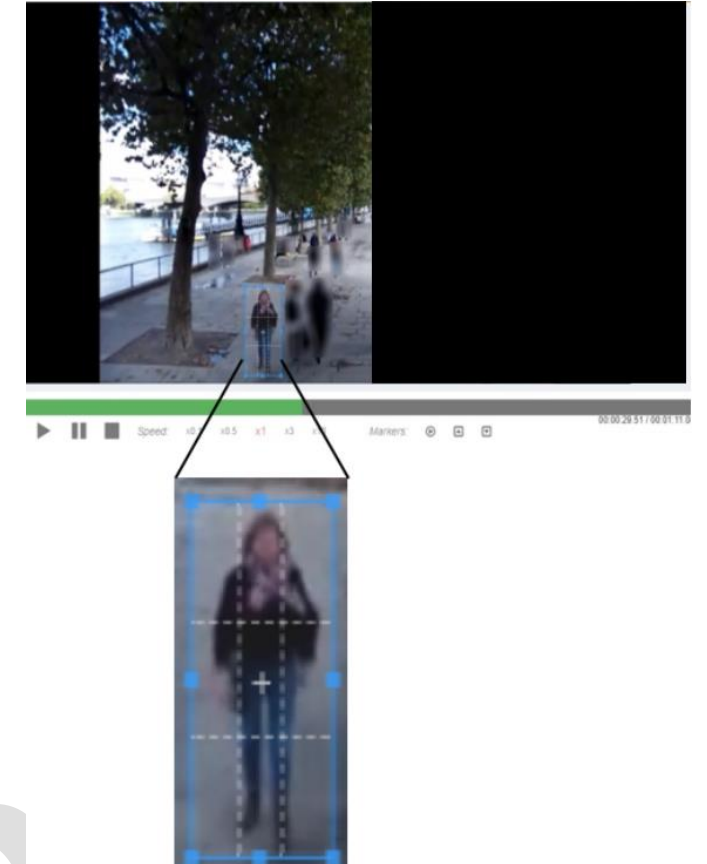
Figure 4: Example screenshot from the SFCT in which a bounding box has been selected around the target-actor depicted in Figure 1b using the TooManyEyes system (with enlarged image below). The functionality of some of the tools provided with the TooManyEyes system is also depicted. Often moving footage can provide more identifiation information than a single frame as depicted here.

This research demonstrated that the TooManyEyes system provides a suitable platform for the Spot the Face in the Crowd Test (SFCT), a different version of which has been employed to test police involved in CCTV review and other similar duties. As expected, consistent with previous research [15], police who have experience of working in a full time Metropolitan Police Service (MPS) CCTV review Super-Recogniser (SR) Unit, some of whom may possess exceptional face recognition ability, significantly outperformed police controls in terms of higher rates of correct identifications of target-actors depicted in the SFCT. SRs' confidence in correct identifications was also significantly higher than controls, again supporting predictions and in line with previous research [15]. However, probably due to low statistical power, from low participant numbers, no differences were found in rates of false bystander identifications (false positives) or correct rejections of empty clips, although the scores were in the expected direction.